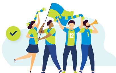
New staff benefit

Having effective EV charging facilities and showing you're taking steps, as a business, to reduce emission levels allows you to provide services to your staff that they can get behind. You can also potentially attract new talent to your business.