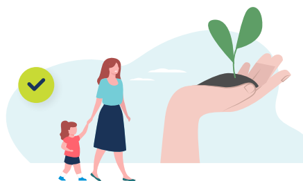
Hit environmental goals