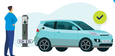
Peace of mind for staff with electric vehicles