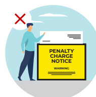
A PCN is issued to any vehicle not registered