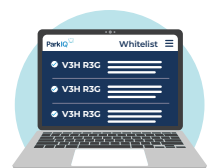
All whitelist data is accessible in ParkIQ