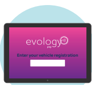
Visitor registers on tablet