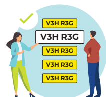
Registration plates are added to whitelist