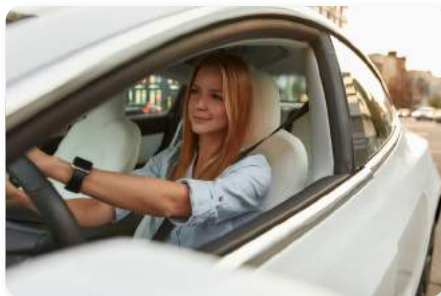
1 A patient enters the car park

Some patients and visitors might need additional assistance from carrying a bag, help with a wheelchair, or a hand getting in and out of a car. Our notification system can relay this information to your teams to ensure the right help is on-hand when the patient parks up outside.