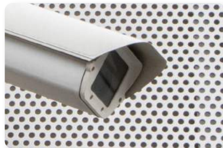
2 ANPR camera logs their vehicle registration